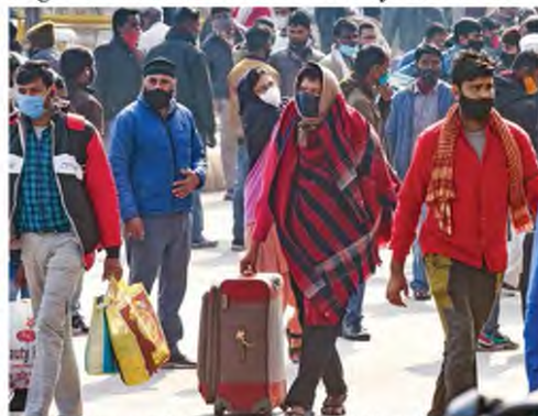
Crowd of passengers at the New Delhi Railway station amid coronavirus pandemic in New Delhi on Tuesday.

Delhi reported 34 fatalities on Sunday and Monday (17 each on these days), compared 54 fatalities in the last five months — nine in December, seven in November, four in October, five in September and 29 in August.