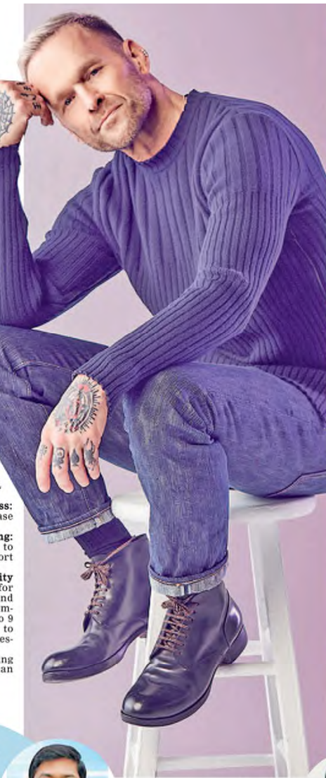
Bob Harper, the celebrity fitness trainer from the TV show The Biggest Loser, suffered a heart attack in 2018. He found that the cause was lipoprotein(a), which few doctors test for

"ADULTS HAVE AN INCREASED RISK OF HEART ATTACK AND CORONARY HEART DISEASE IF THEY HAVE LP(A) LEVELS ABOVE 30 MG/DL. THEY MAY ALSO HAVE AN INCREASED RISK OF ISCHEMIC STROKE IF THEY HAVE LP(A) LEVELS ABOVE 50 MG/DL."